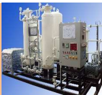
PSA O2 Plant