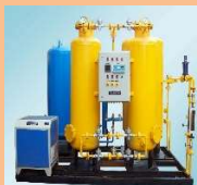
PSA N2 Plant