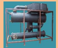
Bio Gas Dryer